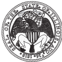
First Great Seal of the State of Illinois (circa 1819-1839)