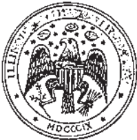
Seal of the Illinois Territory (sketch) (circa 1809-1819)

The Secretary of State is the keeper of the Great Seal of the State of Illinois. Reproduction or use of the state seal or the state flag is permissible only in strict accordance with Chapter 5 of the Illinois Compiled Statutes .